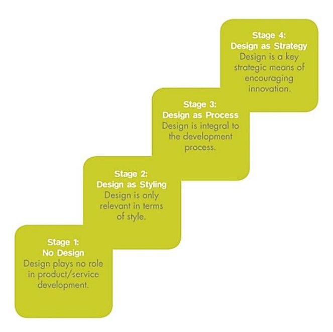
Figure 2 The design ladder (Danish Design Centre 2007). Retrieved from: http://www.seeplatform.eu/casestudies/Design%20Ladder

Zurlo and Cautela (2014, p. 35) assume that design can contribute to the company in several ways and levels of innovation, from styling to the change of ecosystems of product-services and business models.